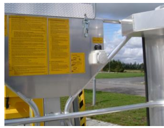
230 V outlet in basket