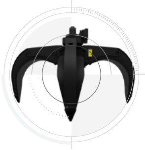
GSH – ORANGE PEEL GRAPPLES