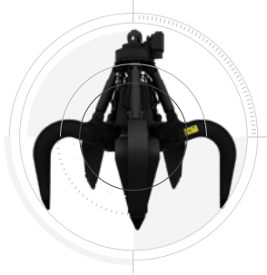
GSV – ORANGE PEEL GRAPPLES